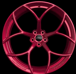
ROSSO PISTA SPECIALE

LINEA SPECIALE optional colors have an extra cost of 250 €* (Price per 4 wheels) . The finishing can be gloss (Lucido) or satin (Opaco) for the same price in all the colors. *All prices are Netto Export without VAT for export outside of Europe EU.