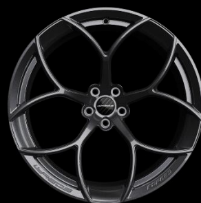
GRIGIO FERRO PERLATO SPECIALE