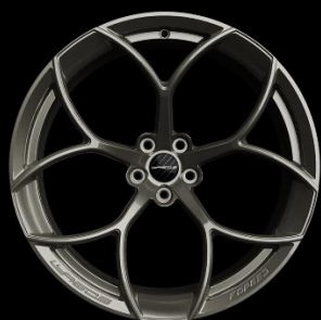
GRIGIO VESUBIO PERLATO SPECIALE