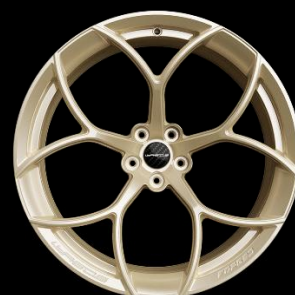
ORO BIANCO PERLATO SPECIALE