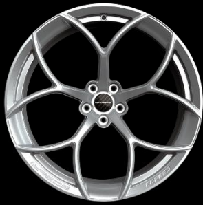
ARGENTO VILLA D'ESTE