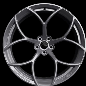
GRIGIO COMPETIZIONE PERLATO SPECIALE