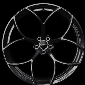
NERO CARBONIO PERLATO SPECIALE