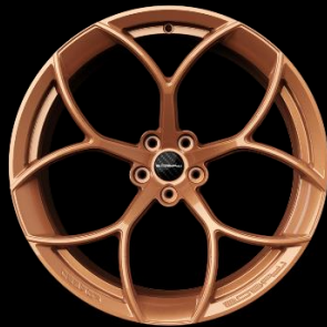
BRONZO CATTIVO SPECIALE

LINEA SPECIALE optional colors have an extra cost of 250 €* (Price per 4 wheels) . The finishing can be gloss (Lucido) or satin (Opaco) for the same price in all the colors. *All prices are Netto Export without VAT for export outside of Europe EU.