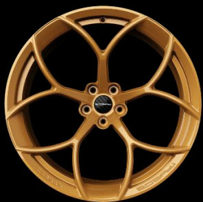
ORO CATTIVO ROSSO SPECIALE