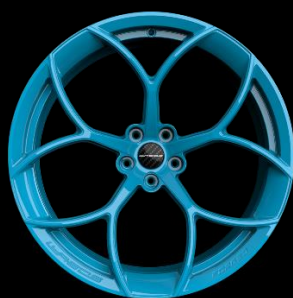
LE MANS RACING BLUE