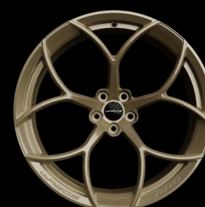
ORO ETNA PERLATO SPECIALE