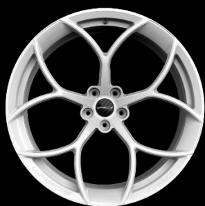
BIANCO MONTE CARLO